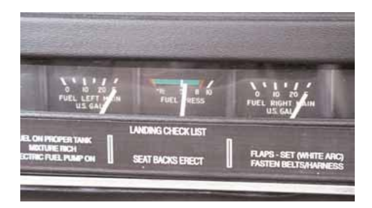
Switch tanks regularly in aircraft that cannot use fuel from both wings simultaneously.

To maintain lateral balance in airplanes that cannot simultaneously feed fuel from both wings, try to keep the tanks as equal as possible (within reason). For example: After takeoff, you might fly for half an hour on the left tank, and then an hour on the right tank, switching hourly thereafter. This should keep you from having more than a half-hour's fuel imbalance at any given time. Many pilots mount a timer in plain view to remind them to switch tanks.