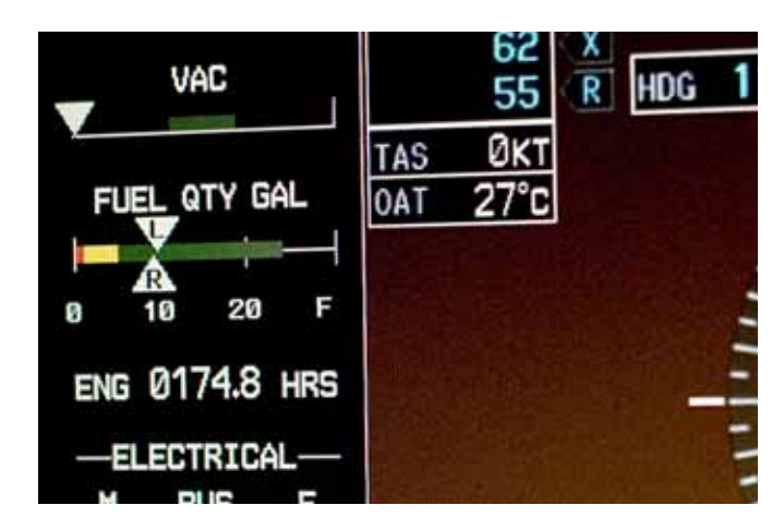
In glass-panel aircraft, fuel quantity may be shown on a multifunction display.

Finally, some sort of fuel quantity indication is provided for the pilot. Some fuel gauges have a yellow arc. Because maneuvering on the ground or in the air could move fuel in the tank away from the outflow ports, fuel represented by the yellow arc should only be used in cruise. Even if there is no yellow arc on the fuel gauge, pilots should avoid sharp turns when entering the runway before takeoff if fuel tanks are not full.