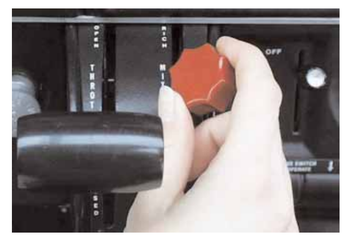
It's impossible to achieve "book" performance, range, or endurance unless you lean the mixture.

Leaning manually: On basic airplanes, set cruise power and lean the mixture until the engine runs rough. Then slowly enrich the mixture until the engine smoothes out. You may see a slight increase in rpm before the engine starts to roughen. If you need to climb to a higher cruising altitude, enrich the mixture before adding power (if you're at or above 75 percent power) and then lean again when level at your new altitude.