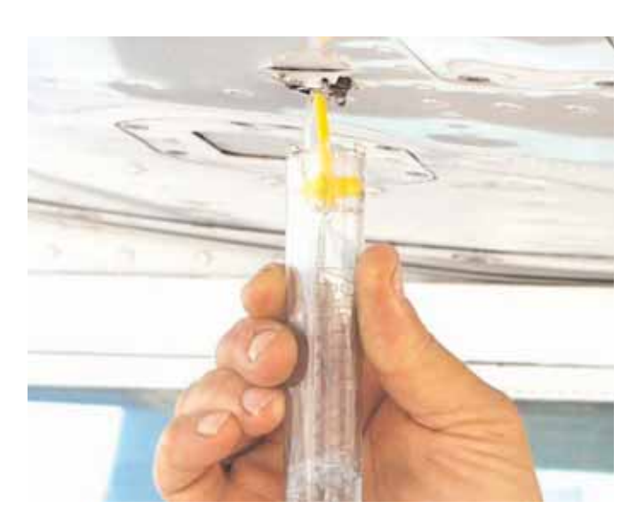
Take samples to verify that you have uncontaminated fuel of the proper type and grade.

3. Know What's in Your Fuel Tanks: Pilots must ensure that their tanks contain the proper grade of uncontaminated fuel. That means making sure that no water has gotten into the tanks, and verifying that the tanks haven't been filled with the wrong fuel. For more information, be sure to read ASF's Misfueling Safety Brief .