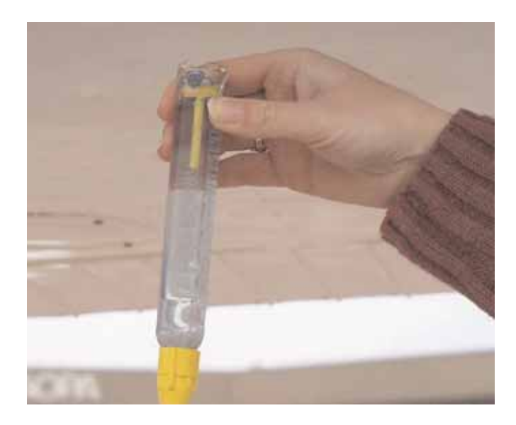
Take a generous fuel sample after allowing time for contaminants to settle.