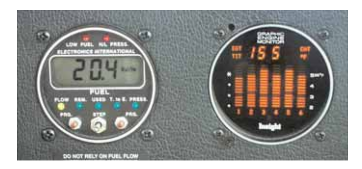
Digital fuel computers and graphic engine monitors can make it easier to track fuel status and lean the mixture properly.

4. Update Your Fuel Status Regularly: Winds are rarely exactly as forecast and weather deviations add miles and minutes to your trip. We recommend that pilots evaluate their fuel status each hour. If you know how many minutes of fuel you have and how long it will take to reach your destination or fuel stop, it's easy to know if you'll need your reserve.