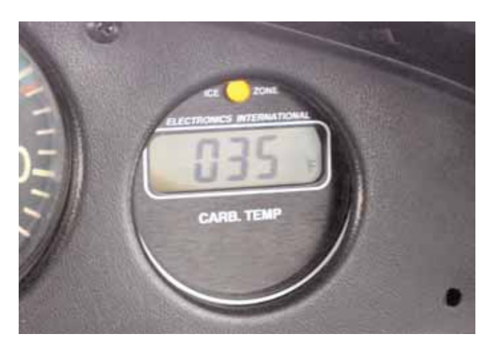
Applying carb heat enriches the mixture and increases fuel consumption for a given power setting.

Operating with carburetor heat results in a richer mixture because the heated air is less dense than ambient air. Pilots should lean while operating with carb heat and enrich when it's no longer needed.