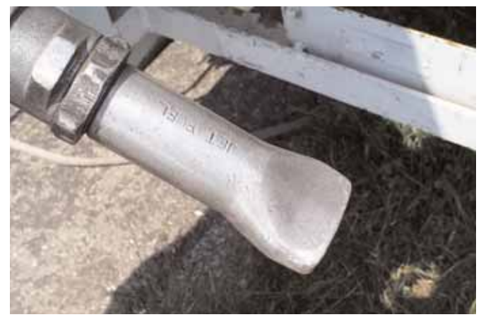
Jet fuel nozzles are shaped like a duck's bill, and will not fit into standard avgas fueling receptacles.

Jet fuel is very different than avgas. Like kerosene, it burns at much higher temperatures than gasoline engines can withstand. Because jet fuel will damage or destroy gasoline engines, a number of safety precautions (color-coded wing decals, special nozzles for jet fuel, etc.) have been put in place to prevent misfueling.