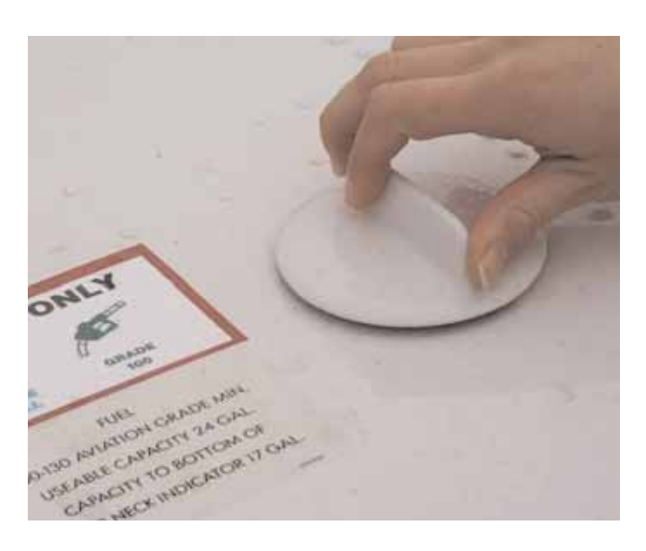
Double check that fuel caps are fastened securely.