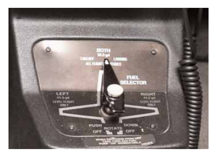
Fuel selectors on some aircraft can be difficult to see and manipulate, particularly in a dark cockpit.

and most low-wing designs have at least two fuel pumps. The main pump is usually mounted on the engine and driven mechanically. The auxiliary electric fuel pump may be used for priming, high-altitude flight, or as an emergency backup should the mechanical pump fail.