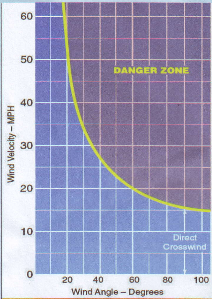
Figure 8-18. Crosswind chart.

Takeoffs and landings in certain crosswind conditions are inadvisable or even dangerous.